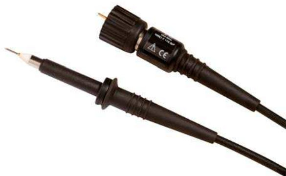
Model 6551 Microline Passive Oscilloscope Probe with Readout Actuator