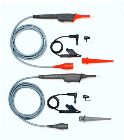
72941, Kit Scope Probes, X10 Insulated, 500 MHz, Red & Gray