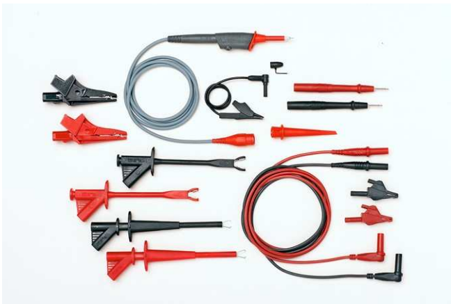
72942, Probe & Lead Kit for Portable Scopes

USA: Sales: 800-490-2361 Fax: 888-403-3360 Europe: 31-(0) 40 2675 150 International: 425-446-5500 e-mail: technicalsupport@pomonatest.com