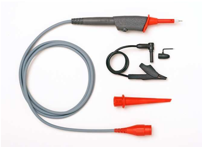
72940-2, X10 Insulated, 500 MHz, Red (additional photos on page 2)

Insulated Scope Probes for use with portable Oscilloscopes.