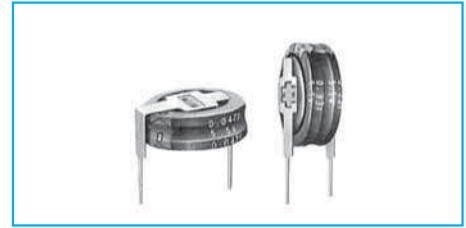
Marking color : White print on a black sleeve