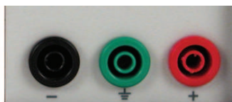
The 9120 series uses 4mm sheathed banana jacks that accept sheathed or shrouded banana plugs and meet the latest international safety standards.

Included Accessories: User manual, power line cord, IT-E131 RS232 to TTL serial converter cable, IT-E132 USB to TTL serial converter cable, software installation disk, and certificate of calibration. Model 9123A also includes IT-E135 GPIB to TTL conversion adapter cable. Optional: IT-E151 rack mount kit.