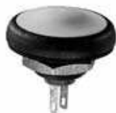
Threaded bushing IFS3Z1AD NO