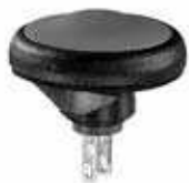
Snap-in IFB3Z1AD NO