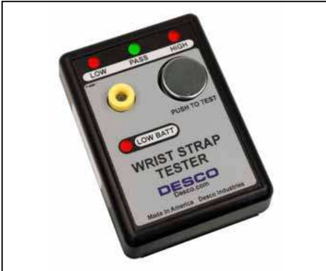
Figure 1. Desco 19240 Wrist Strap Tester