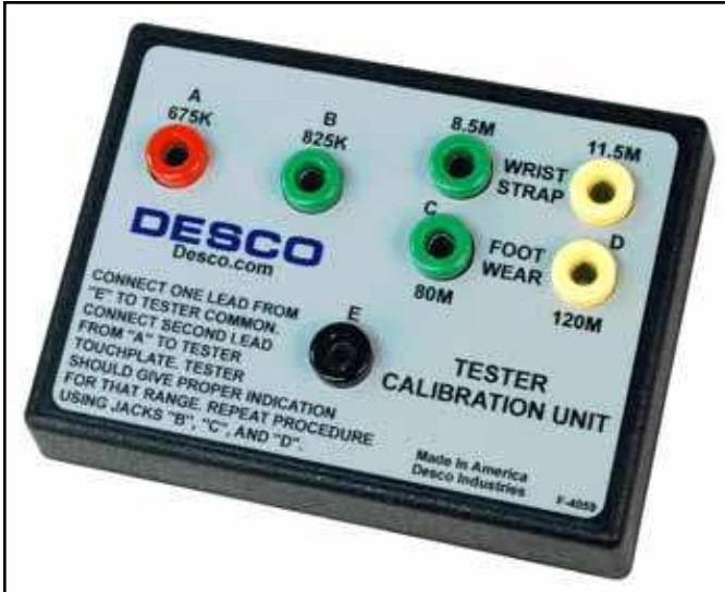
Figure 3. Desco 07010 Calibration Unit

View technical bulletin TB-2039 for more information on the 07010 Calibration Unit and instructions to calibrate the Wrist Strap Tester.