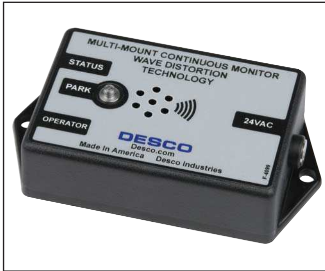
Figure 1. Desco Multi-Mount Continuous Monitor.