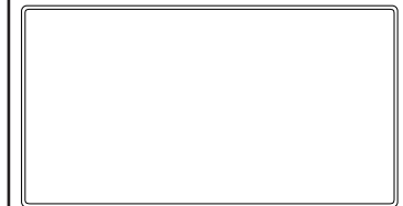
Steel wire perimeter reinforcing frame for extra strength and durability