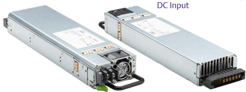
Connector input shown

Distributed Power Bulk Front-End Total Output Power: 450 - 550 Watts +12 Vdc main Output +3.3 Vdc Stand-by Output DC Input 36 - 75 Vdc