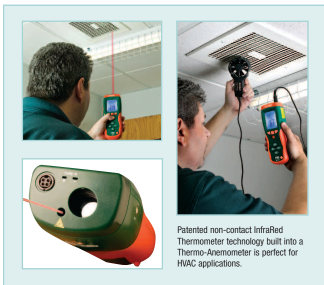
Patented non-contact InfraRed Thermometer technology built into a Thermo-Anemometer is perfect for HVAC applications.