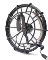
Camera probes with cable length greater than 3m will be coiled on a spool as shown on the left.