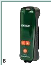
A. Articulating (6mm diameter) camera tip adjusts up to 240° viewing angle with four built-in bright LED lights illuminate dark areas B. HDV-WTX — Optional Wireless Transmitter transmits video to the main display from tight or hard to reach places up to 100ft (30m) away