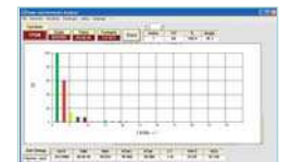
Software Harmonics Analysis