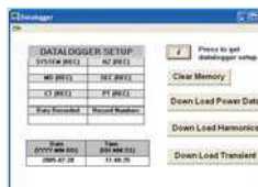
Software included to download, store data and display on a PC