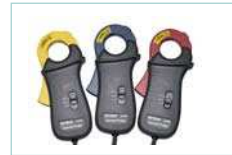
Optional 100A Current Clamp Probes (Model 382097) with 1.2" (30mm) jaw size