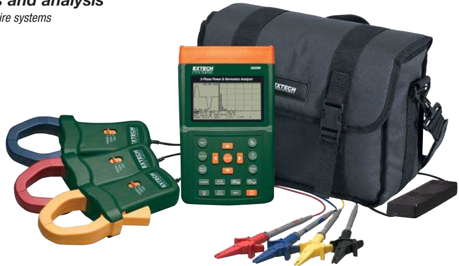
Complete with (3) 1000A current clamps, 4 voltage leads with alligator clips, 8 AA batteries, AC adaptor, software, PC interface cable, and carrying case