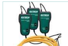
Optional 3000A Flexible Current Clamp Probes 24" (610mm) long for wrapping around busbars (Model 382098)