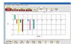
Software Harmonics Phase Analysis