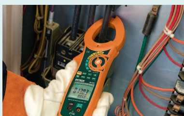
2.0" (52mm) jaw size for conductors up to 500MCM