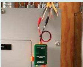
Use for local continuity or for remote wiring identification.

Continuity Tester includes Remote probe with bi-color LED for wire identification highlight