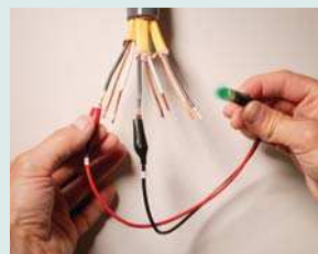
GREEN LED means wiring is properly identified.