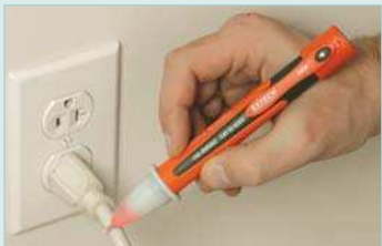
Quickly check for the presence of live wires before testing