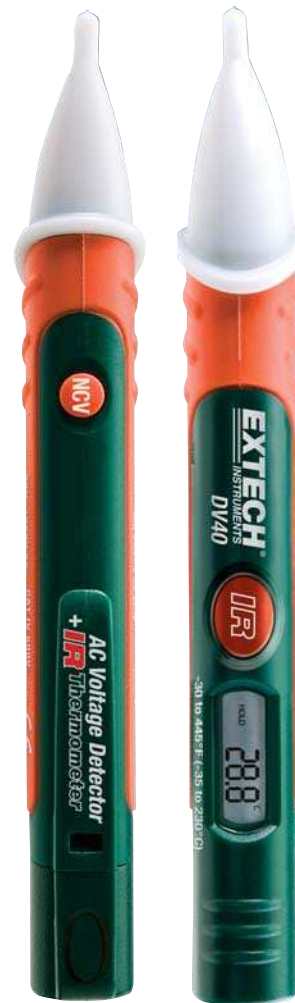
Non-Contact AC Voltage Detector