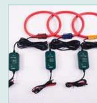
Model PQ34-30 3000A (24"/600mm) Flexible Current Clamp Probes for wrapping around busbars