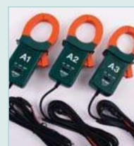
Model PQ34-12 1200A Current Clamp Probes with 2" (50mm) jaw size