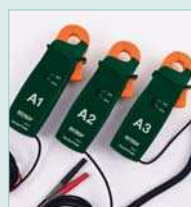
Model PQ34-2 200A Current Clamp Probes with 0.8" (19mm) jaw size

Choose the best clamp probes to fit your application needs ranging from 200A to 3000A and flexible vs traditional jaw type.