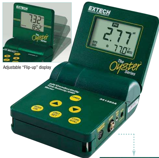
Adjustable “Flip-up” display