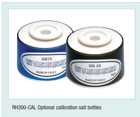
RH300-CAL Optional calibration salt bottles