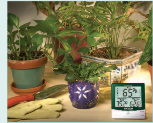
Checks the Humidity and Temperature levels for optimal plant growth in greenhouses.