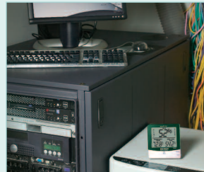
Alerts low Humidity levels in Computer rooms to help prevent electrostatic conditions.