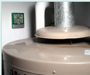
Monitoring Dew Point levels in a Basement for potential mold growth.