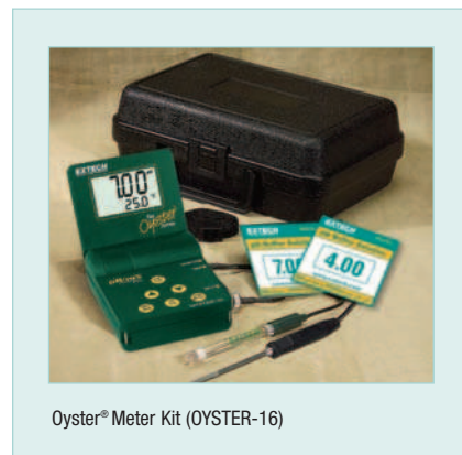
Oyster® Meter Kit (OYSTER-16)