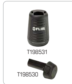
Additional Accessories Included with E8