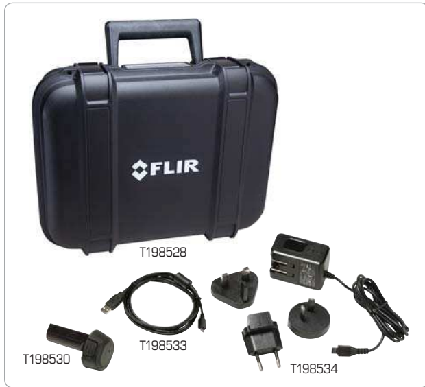
Included in All Models