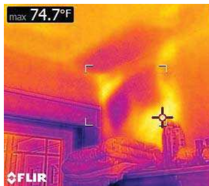
Missing Insulation – Summer Day E6 with MSX