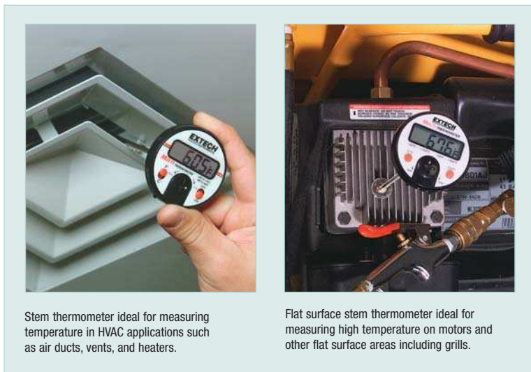
Stem thermometer ideal for measuring temperature in HVAC applications such as air ducts, vents, and heaters.