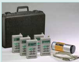
407355-KIT-5 Dosimeter Kit

Includes PC Windows® compatible software to maintain records and statistically analyze acquired data