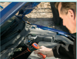
Max hold indicates and holds the peak temperature for easy identification of hot spots