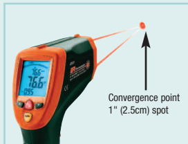
Two laser points converge at a distance of 50"/(127cm) and form a 1" (2.5cm) spot.