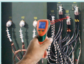
Fast response captures hot spots