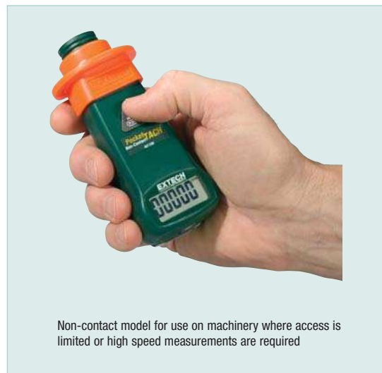
Non-contact model for use on machinery where access is limited or high speed measurements are required