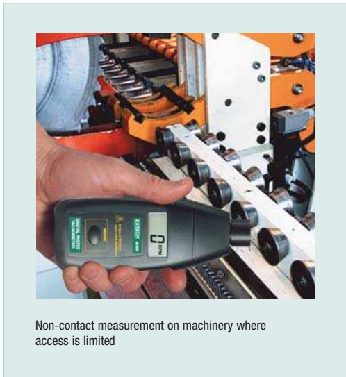
Non-contact measurement on machinery where access is limited