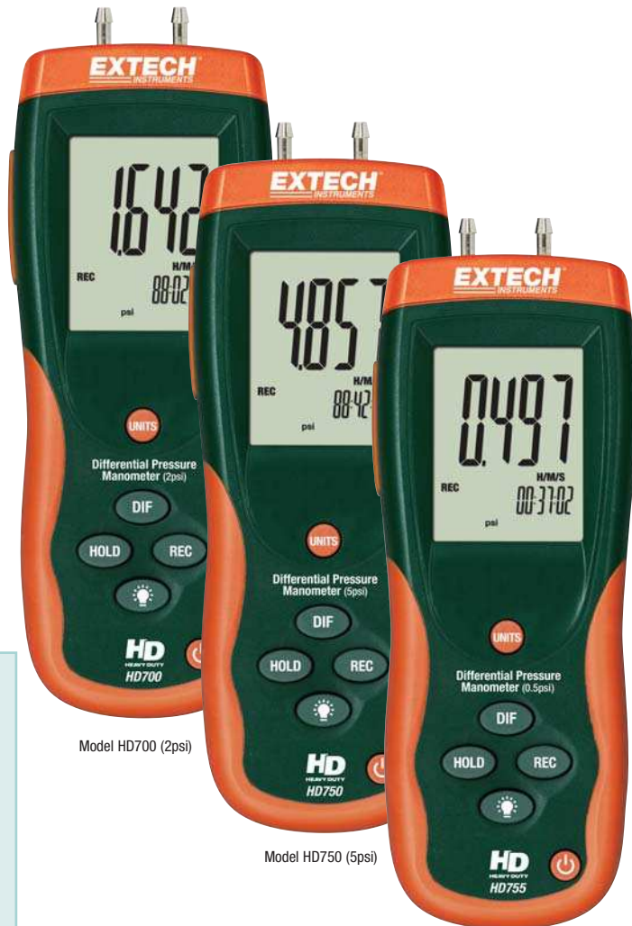
Model HD700 (2psi)