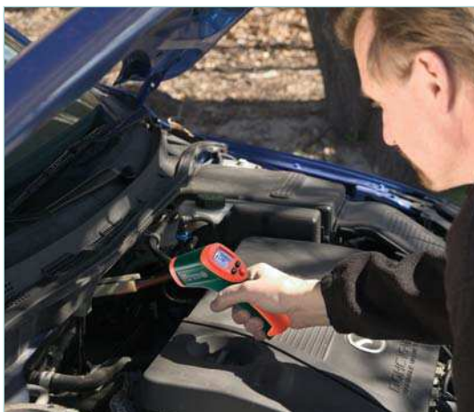
Ideal for automotive applications