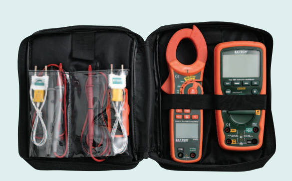
Large soft case conveniently fits meters and accessories for easy storage and transportation.