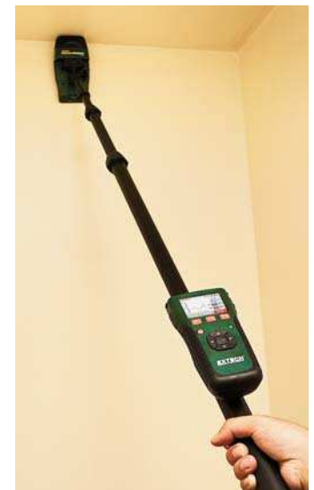
Wireless sensor affixes to telescoping handle