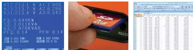
Backlit LCD displays numerical values. The data can be stored in SD memory card (included) and then transferred from meter to PC using Excel ® software and datalogged readings.

Complete with 4 voltage leads with alligator clips, 8 AA batteries, SD memory card, Universal AC adaptor (100 to 240V), and case. Clamp probes sold separately.