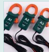
Model PQ34-12 1200A Current Clamp Probes with 2" (50mm) jaw opening