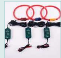
Model PQ34-30 3000A (24"/600mm) Flexible Current Clamp Probes for wrapping around busbars