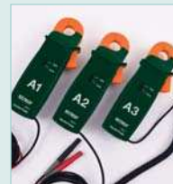
Model PQ34-2 200A Current Clamp Probes with 0.8" (19mm) jaw opening

Choose the best clamp probes to fit your application needs ranging from 200A to 3000A and flexible vs traditional jaw type.