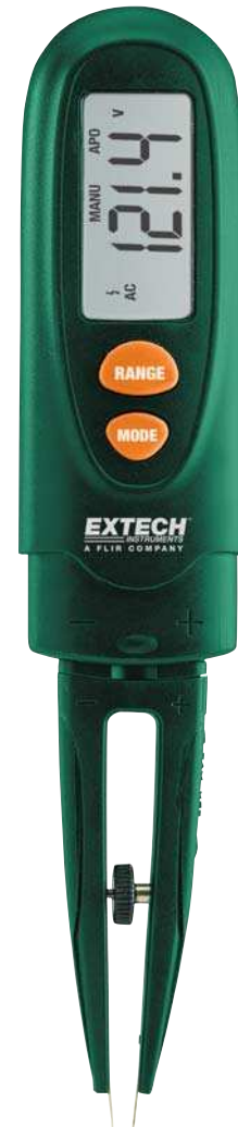
Take voltage measurements using the attachable test lead tip (RC200-TL)