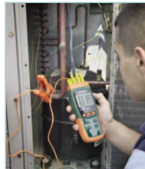
Simultaneously measures 4 temperature inputs for multiple source monitoring