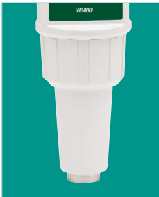
Magnetic base included