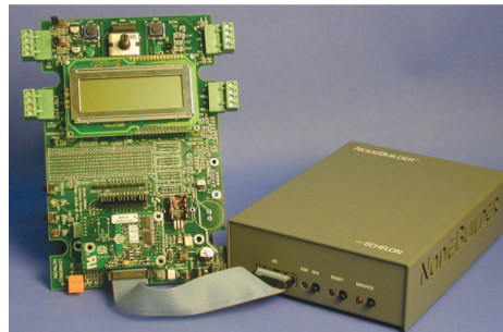
Gizmo 4 plugged into the LTM-10A Platform

The NodeBuilder Gizmo 4 I/O Board is included with the NodeBuilder FX/PL Development Tool. You can use this collection of I/O devices with the LTM-10A Platform to develop prototype devices and I/O circuits, develop special-purpose devices for testing, or run the NodeBuilder examples.