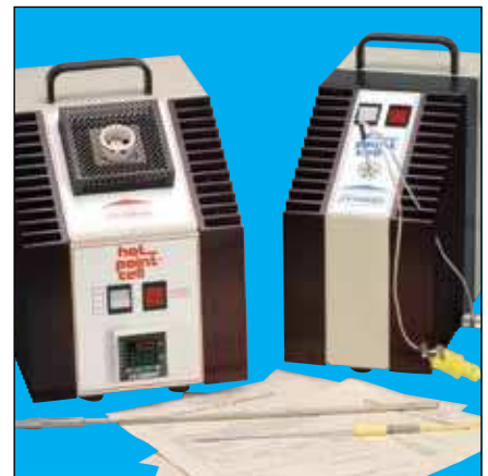
TRCIII ice point™ shown with companion CL950 dry block probe calibrator. See newportUS.com for details.

The TRCIII ice point™ Calibration Reference Chamber relies on the equilibrium of ice and distilled, deionized water at atmospheric pressure to maintain 6 reference wells at precisely 0°C (32°F). The wells extend into a sealed cylindrical chamber containing the distilled, deionized water. The outer walls of the chambers are cooled by thermo-electric cooling elements. The increase in volume produced by the creation of ice crystals within the