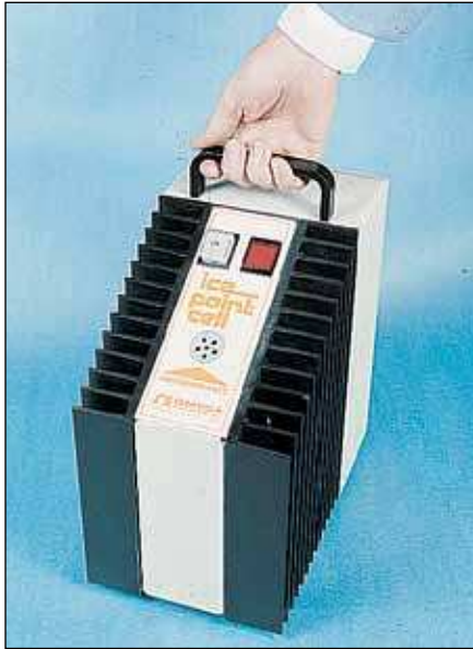
Sturdy handle for easy portability.