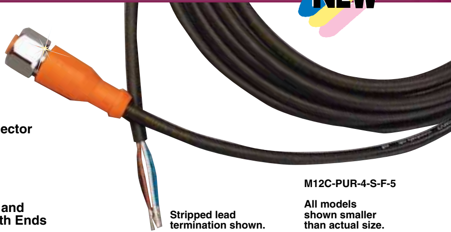
Stripped lead termination shown.