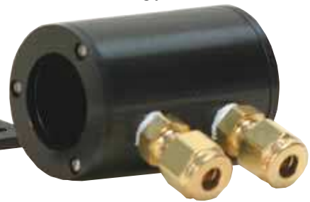
OS100-WC water cooling jacket.