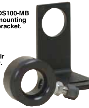
OS100-MB mounting bracket.