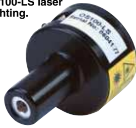
OS100-LS laser sighting.