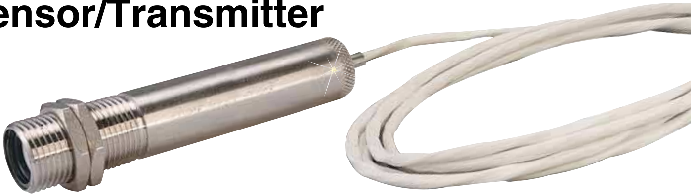
OS136 miniature stainless steel sensor/transmitter with NEMA 4 housing shown actual size.

Each unit includes 2 hex mounting nuts, 1.8 m (6') shielded cable and operator's manual.