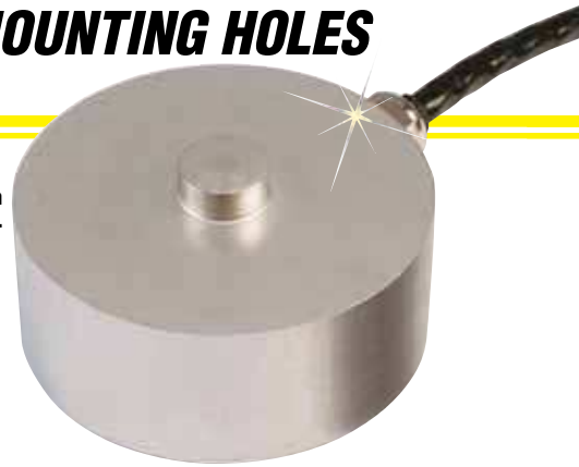
LC305-1K, shown actual size.

Available with cable or twist-lock connector.