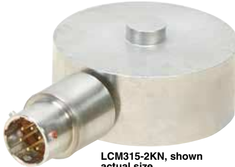
LCM315-2KN, shown actual size.

Available with cable or twist-lock connector.