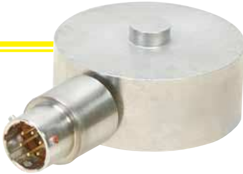
LC315/LCM315 models with twist-lock connector.