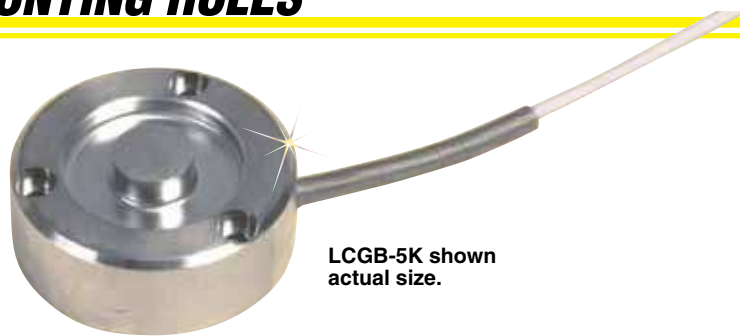
LCGB-5K shown actual size.

The LCGB Series comprises miniature low-profile compression load cells with excellent long-term stability. An all stainless steel construction ensures reliability in harsh industrial environments. These cells are designed to be mounted on a flat surface using cap screws to secure them to the base. A load button is integral to their basic construction for even force distribution.