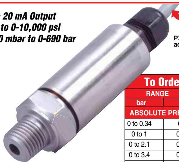
PX309-030GI shown actual size.

4 to 20 mA Output 0-1 to 0-10,000 psi 0-70 mbar to 0-690 bar