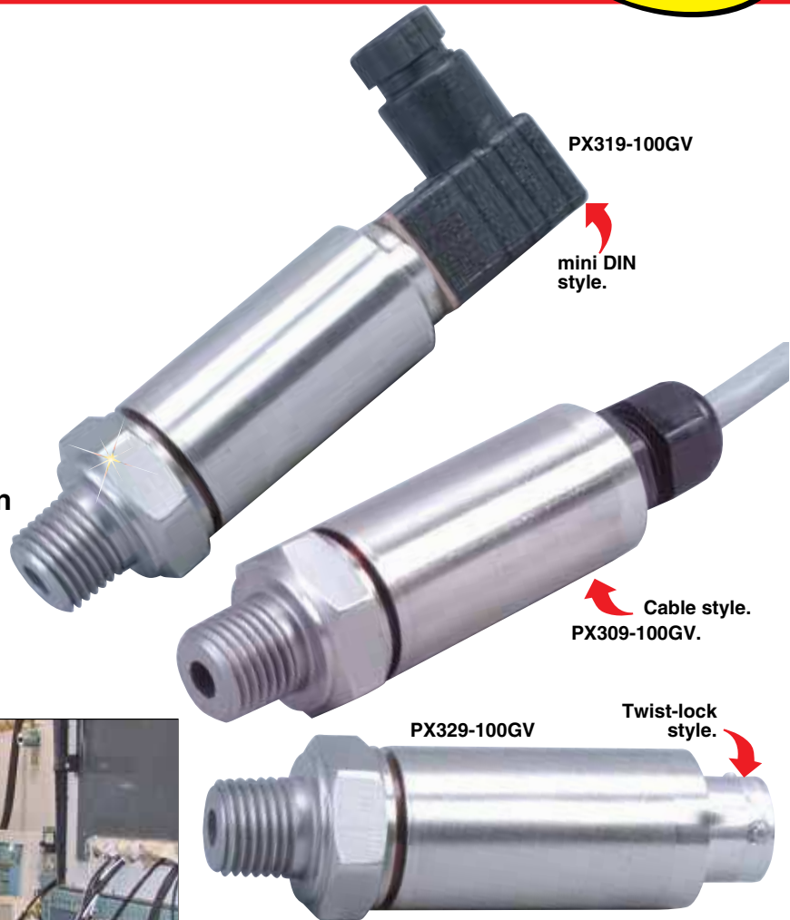
All models shown actual size.