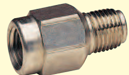
PS-4G, $12.75, shown actual size.

Order a snubber to protect your pressure transducer!