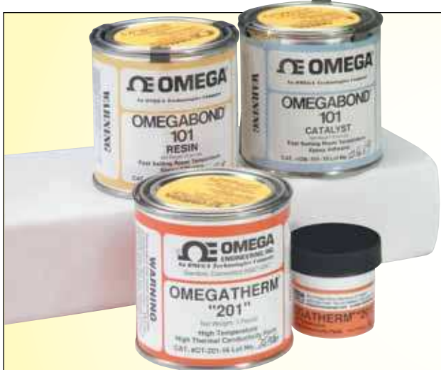
OMEGABOND®, see accessory chart or visit newportUS.com for additional information.