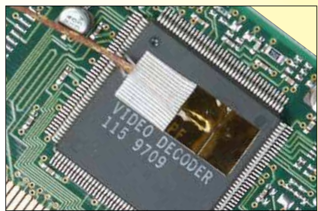
The self-adhesive mounting strip is ideal for “targeted” placement of the sensor element. Once the element is in place, it can be used “as is”, for applications such as electronic component temperature monitoring during board fabrication. It can also be cemented in place using OMEGABOND® for higher temperatures.