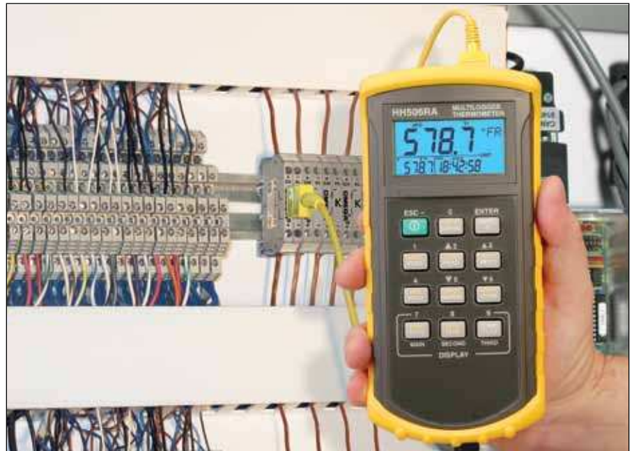
Shown with RECK1-10 cable, and the HH506RA datalogger/thermometer, with RS232C interface.

The new DRTB Series thermocouple terminal blocks are manufactured with thermocouple-grade alloys to guarantee accurate readings. A built-in SMP-compatible female receptacle accepts a miniature thermocouple connector. The female connector allows the user to connect to a handheld meter for applications such as data collection, quality assurance compliance, capability studies and trouble shooting installation or repairs.