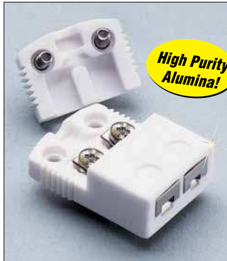
SHX Series Basic Male Connector

SHX subminiature connectors are ideal for use with fine gage thermocouple wires in applications where high temperatures are required. The SHX connector is permanently dot-coded to conform to ANSI and NEWPORT standards; for applications such as high vacuum furnaces where contamination would adversely affect the process, USHX connectors are shipped with a removable color-coding dot. Two-piece ceramic construction assures long life, while the oversized terminal screws allow for easy wiring.