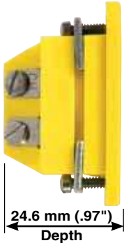
24.6 mm (.97") Depth