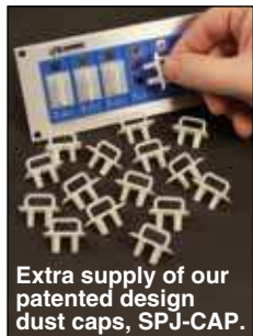
Extra supply of our patented design dust caps, SPJ-CAP.

Panel jacks contain two female, collet-type, spring-loaded connectors that will accept any standard male thermocouple connector. The panel jacks are molded of high-impact, glass-filled nylon and are numbered and labeled as well as color-coded.