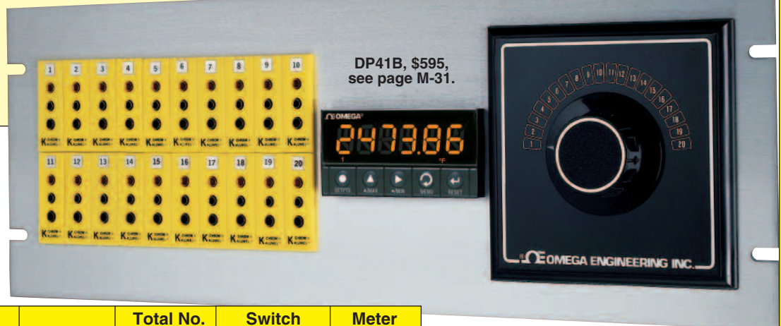
DP41B, $595, see page M-31.