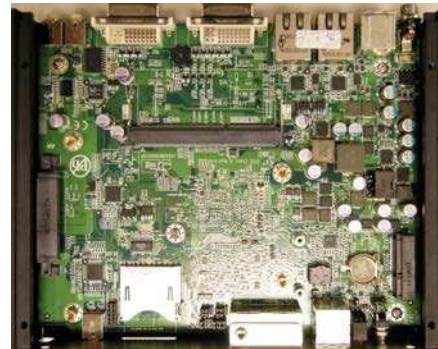
» Fanless Design